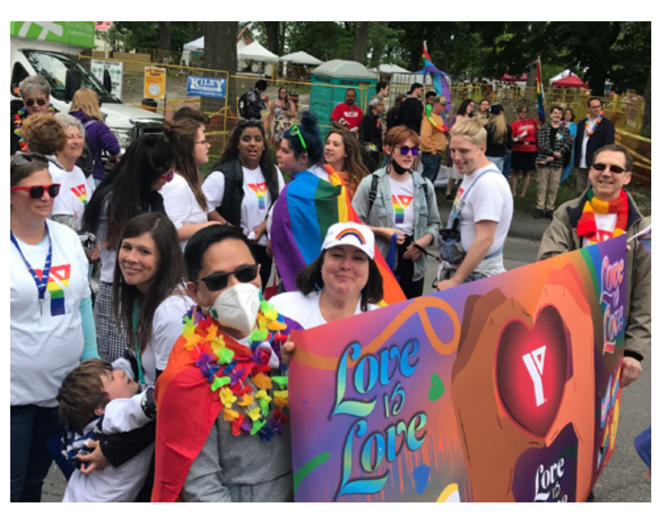
The YMCA of Eastern Ontario came out in full force to participate in Pride. #loveislove